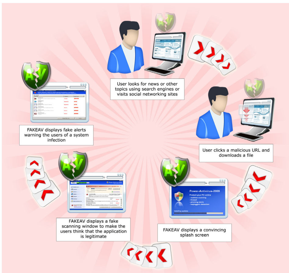
Figure 1. Typical FAKEAV infection diagram

▶ Rogue antivirus aka FAKEAV remains one of the most notorious and pervasive malware threats today.